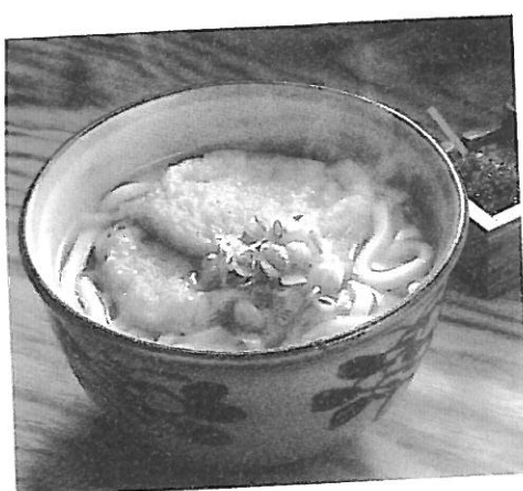
うどん Udon Noodle

Osaka has been the Japanese center of international exchanges since ancient times as an advanced city with warm hospitality. Osaka is full of tourist attractions such as Osaka Castle symbolizing the history and tradition of Osaka, and is proud of Bunraku Puppet theater, UNESCO's World Cultural Heritage, and our famous food culture.